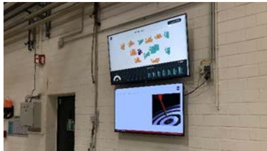
Figure 1. Machine availability information shared with employees on the shop floor for enhanced transparency and continuous improvement

Using the 3d Signals solution, SAMSON AG now for the first time have automated and reliable visibility into the production floor, providing an accurate and real-time status of machine availability across their factories, and enabling improved processes by facilitating data-driven decision making.